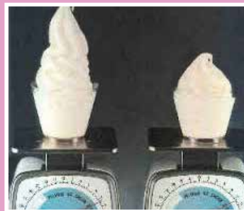
The amount of air, known as overrun, in the dish of soft-serve ice cream on the left is 65%, versus 35% on the right.

The amount of air also has a huge effect on the density of the ice cream. A gallon (3.8 liters) of ice cream must weigh at least 4.5 pounds, making the minimum density 0.54 gram per milliliter (or 540 grams per liter). Better brands have higher densities—up to 0.9 grams per milliliter. The next time you visit a grocery store, compare cheaper and more expensive brands by holding a container in each hand—you should be able to notice a difference. Then read the net weight on the