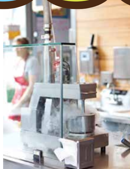
Ice cream shops serving desserts made with liquid nitrogen are unique and very popular.

Note: If you are concerned about the ambiguity of these answers, now you know why ice cream historians are still arguing about the origins of ice cream!